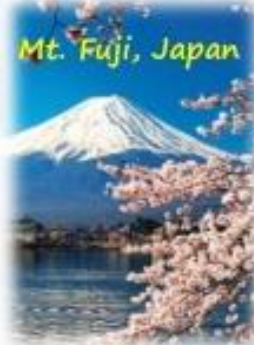
Mt. Fuji, Japan