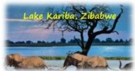
Lake Kariba, Zimbabwe