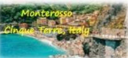
Monterosso Cinque Terre, Italy