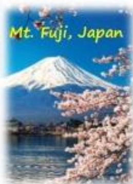
Mt. Fuji, Japan