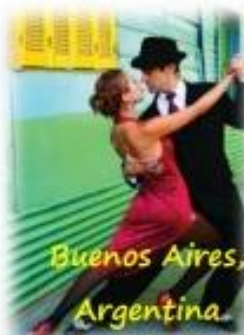
Buenos Aires, Argentina