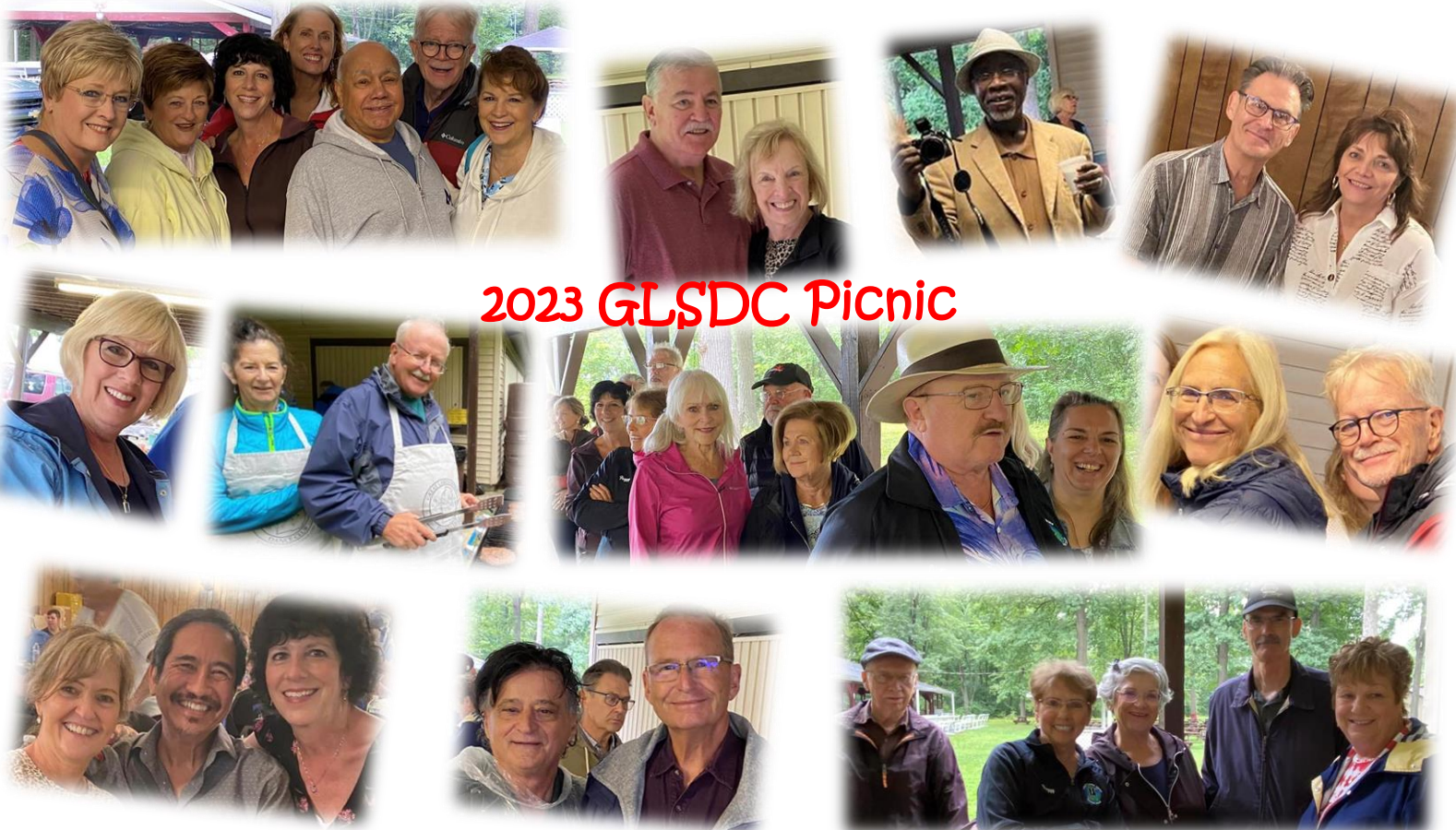
2023 GLSDC Picnic