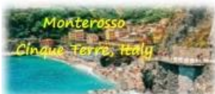
Monterosso Cinque Terre, Italy